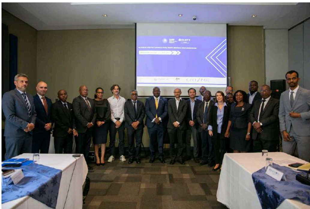
Officials after the In-Person Meeting of National Focal Points for the Regional Drug Observatory in Nairobi.