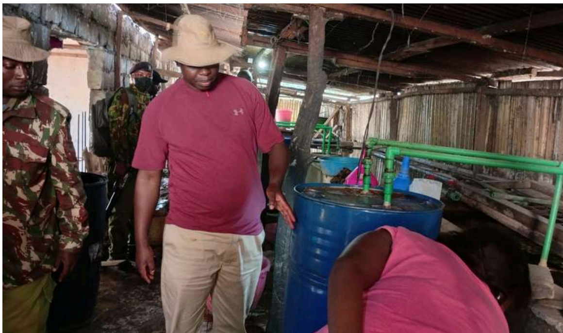
The operation that led to the arrest of a notorious brewer in Mbeu Village, Tigania East