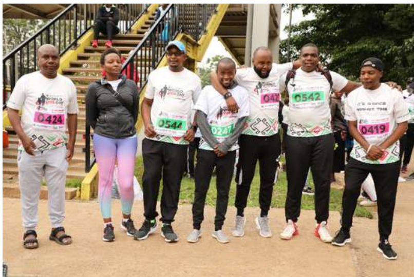
NACADA team during the Nairobi city county marathon on world AIDS day at Nyayo national stadium in Nairobi.