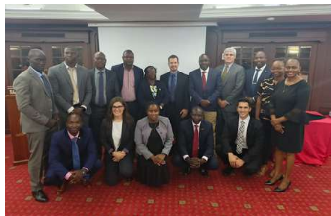
NACADA staff attending the training

For NACADA, this training reinforces our capacity to address narcotics-related challenges within the broader framework of our mandate. The knowledge gained will be instrumental in strengthening our role in prevention, enforcement, and policy advocacy. The lessons learned will undoubtedly translate into more effective strategies for combating narcotics in Kenya. The ripple effect of this capacity-building initiative will enhance our collective efforts to protect communities from the devastating impact of drug abuse.