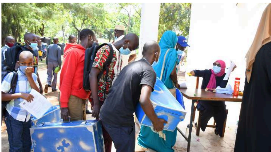
Shimo La Tewa receives form ones, 2021